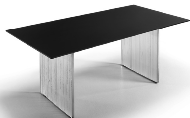
Table with base made of two separate 30 mm DV Glass elements, transparent or with colored stripes. Top available in 12* or 15 mm transparent glass, back-lacquered with monochrome finishes, or hand-finished with Ecomalta, finer-grained texture finish.

Tavolo con base composta da due elementi in DV Glass da 30 mm trasparente o a strisce colorate. Piano in vetro da 12 mm* o da 15 mm trasparente retroverniciato con tinte monocromatiche, oppure ricoperto in Ecomalta in Ecomalta spatolata tipo fine.